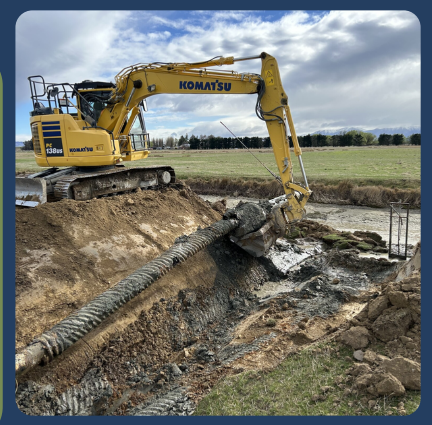
Redundant Take Removal & Race Repair