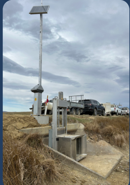
Eweburn Syphon Automation Rubicon